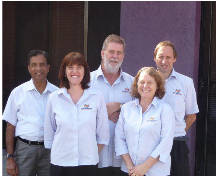
Pictured: The team at Paramount Business Supplies

Partitions for your requirements from local suppliers.